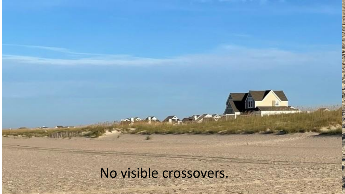
No visible crossovers.