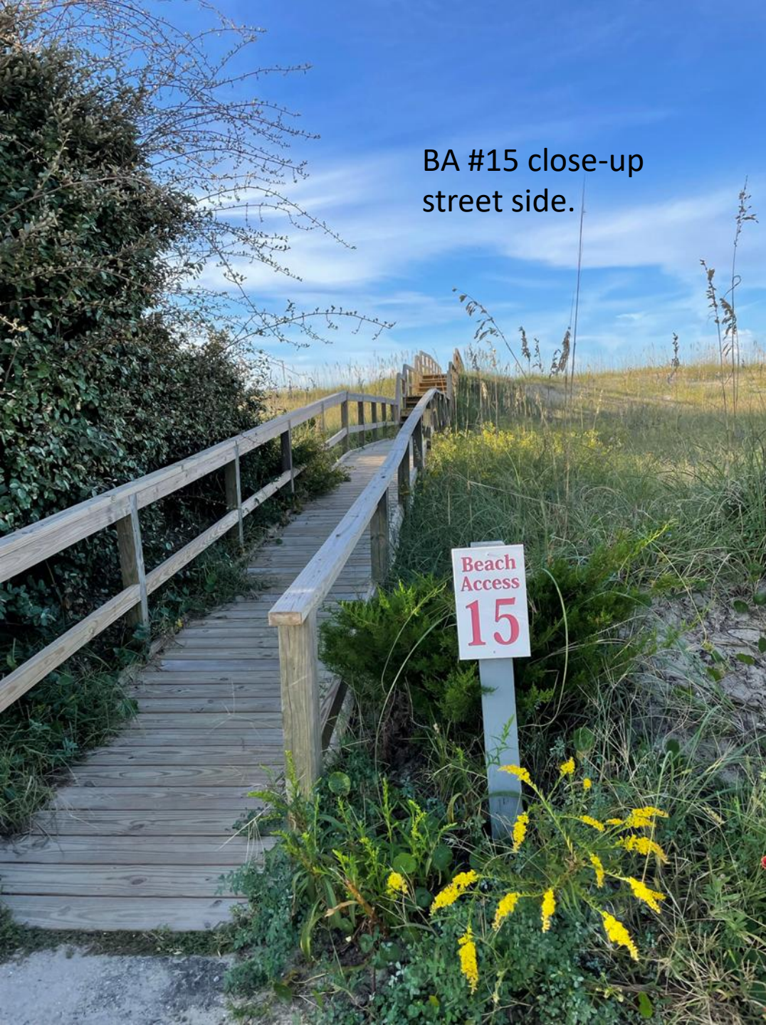
BA #15 close-up street side.