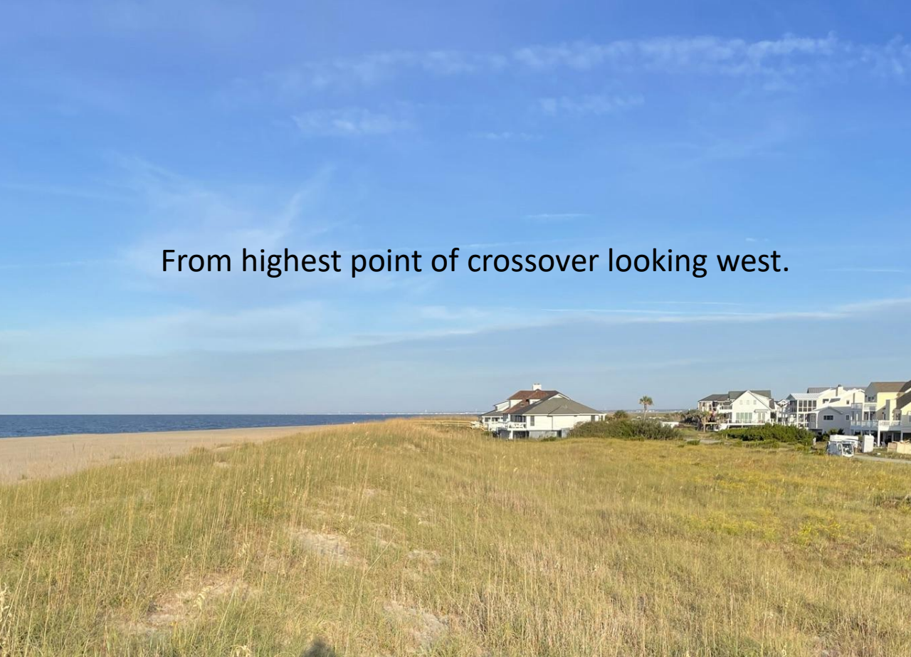
From highest point of crossover looking west.