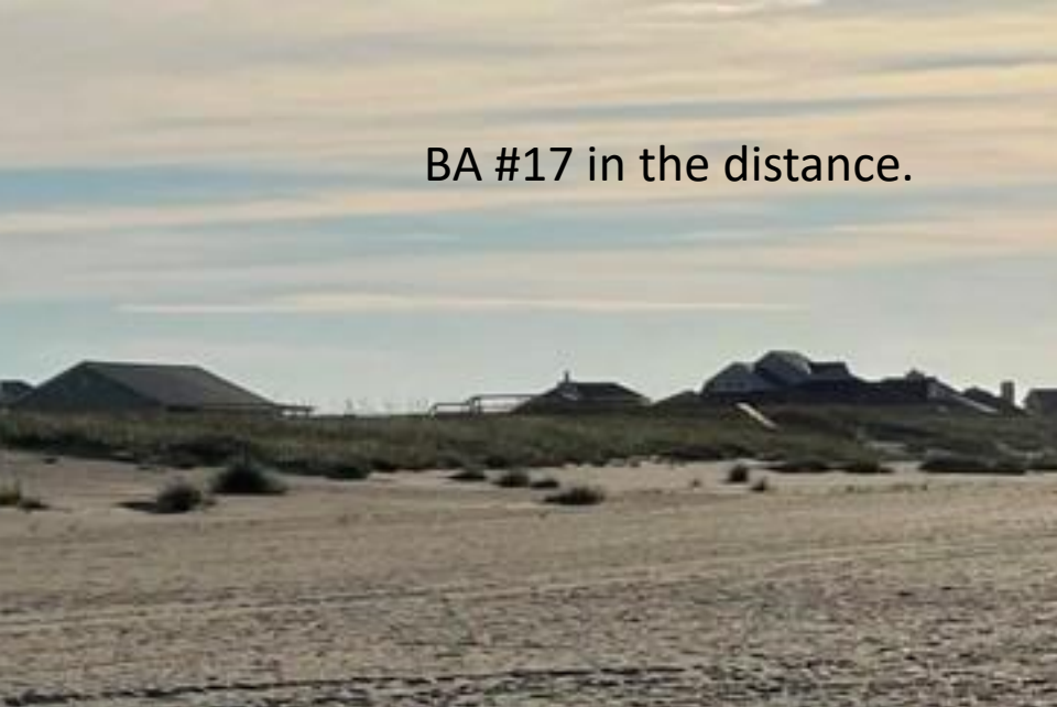
BA #17 in the distance.