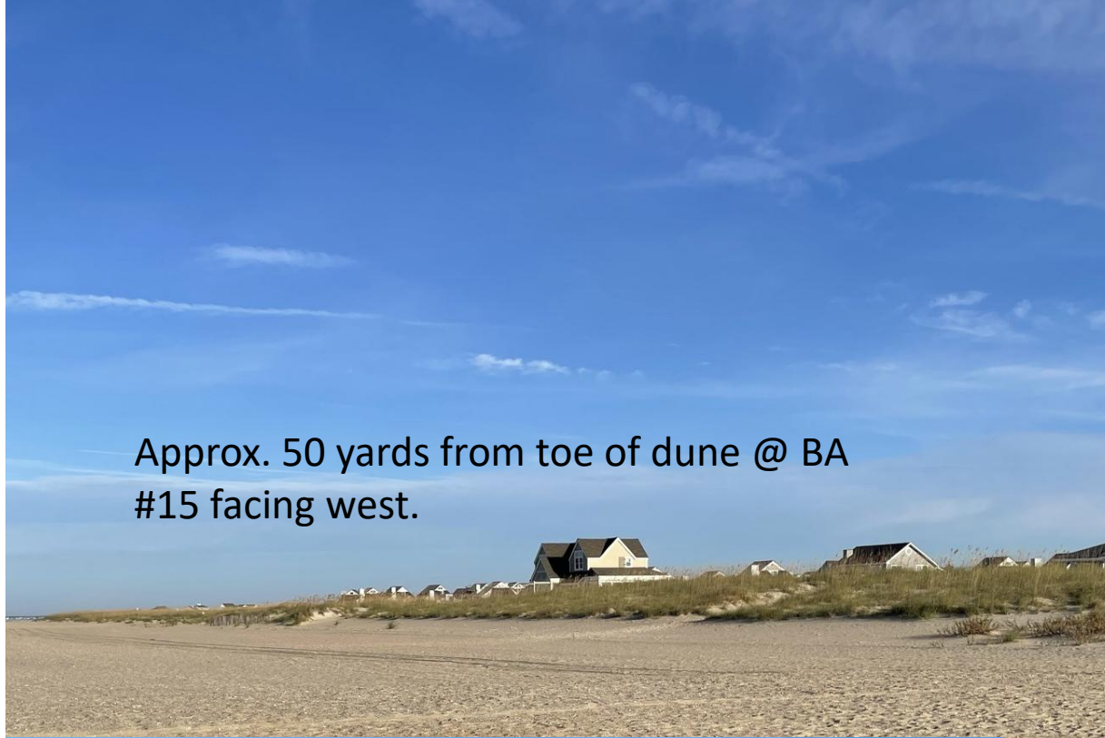
Approx. 50 yards from toe of dune @ BA #15 facing west.