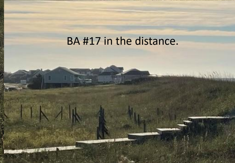
BA #17 in the distance.