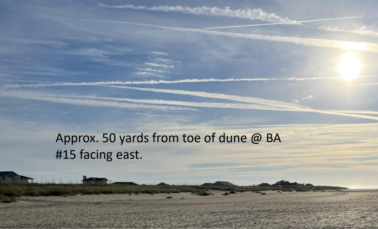
Approx. 50 yards from toe of dune @ BA #15 facing east.