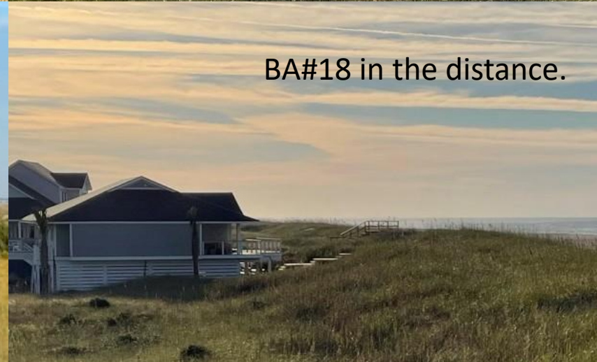
BA#18 in the distance.