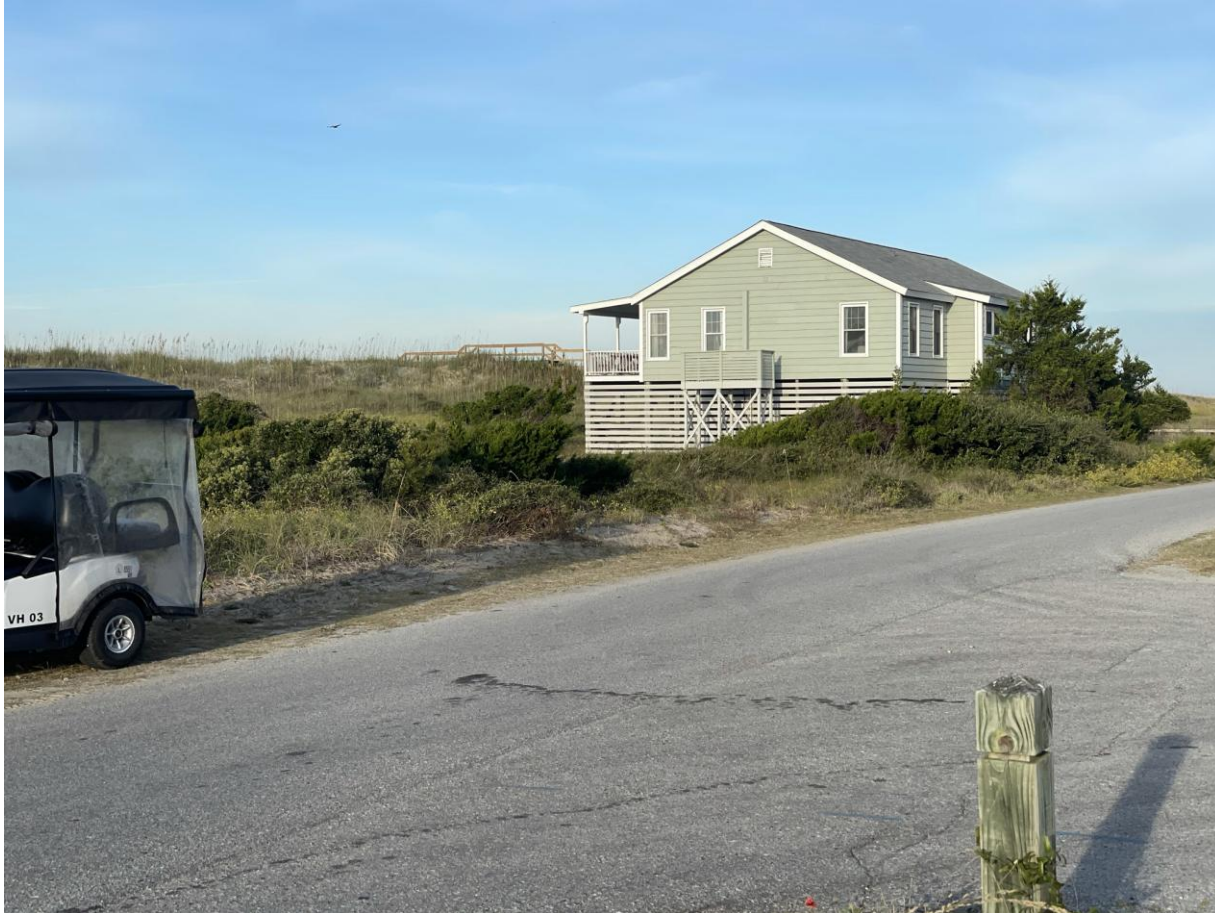
From street facing west.