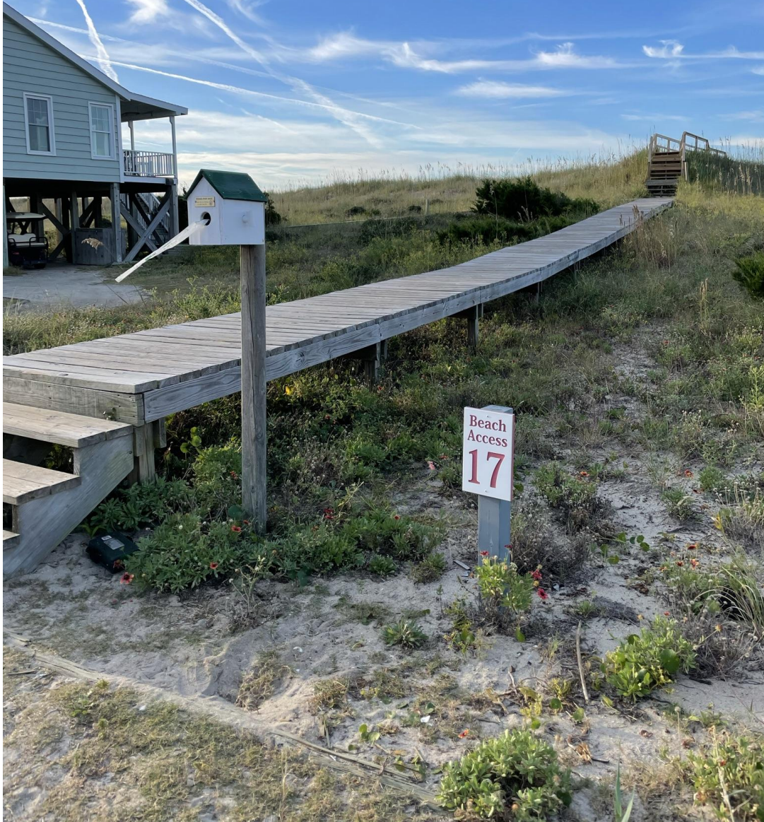
Close-up street side.