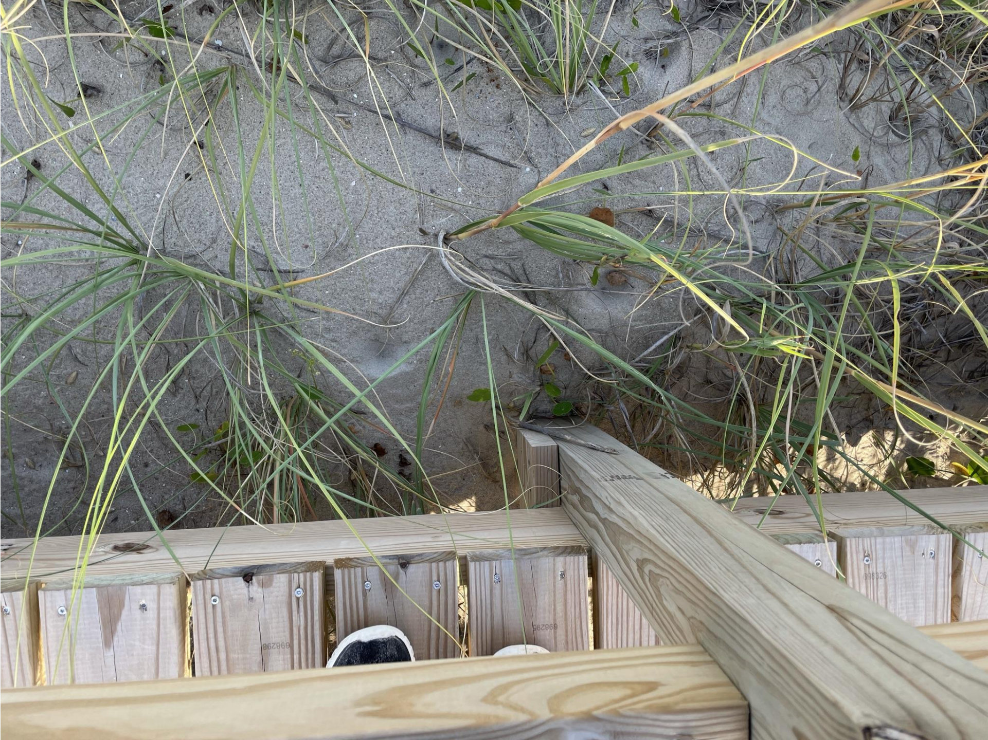
Highest portion of crossover.