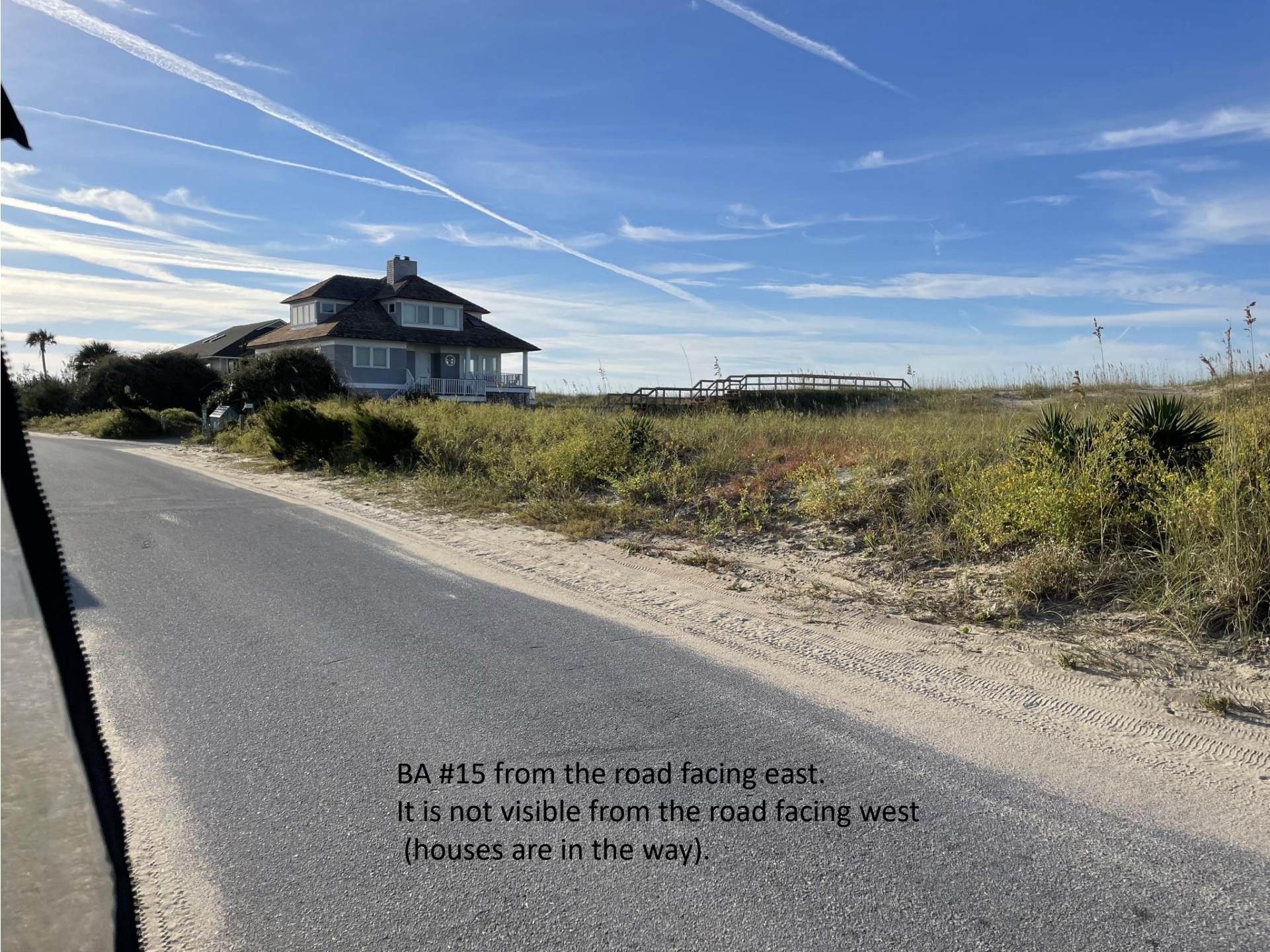
BA #15 from the road facing east. It is not visible from the road facing west (houses are in the way).